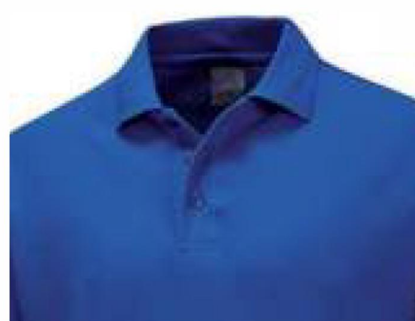
线迹图 Stitch Sample