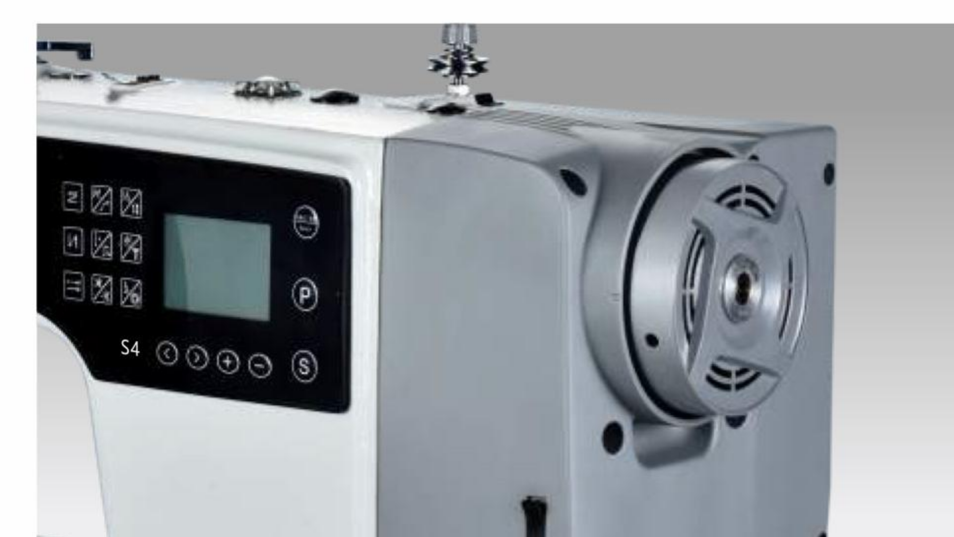
大风力手轮加大进气量，降低电机电控温度，提高使用寿命 High efficiency hand wheel, with better air ventilation: reduce the temperature of the motor and control box.