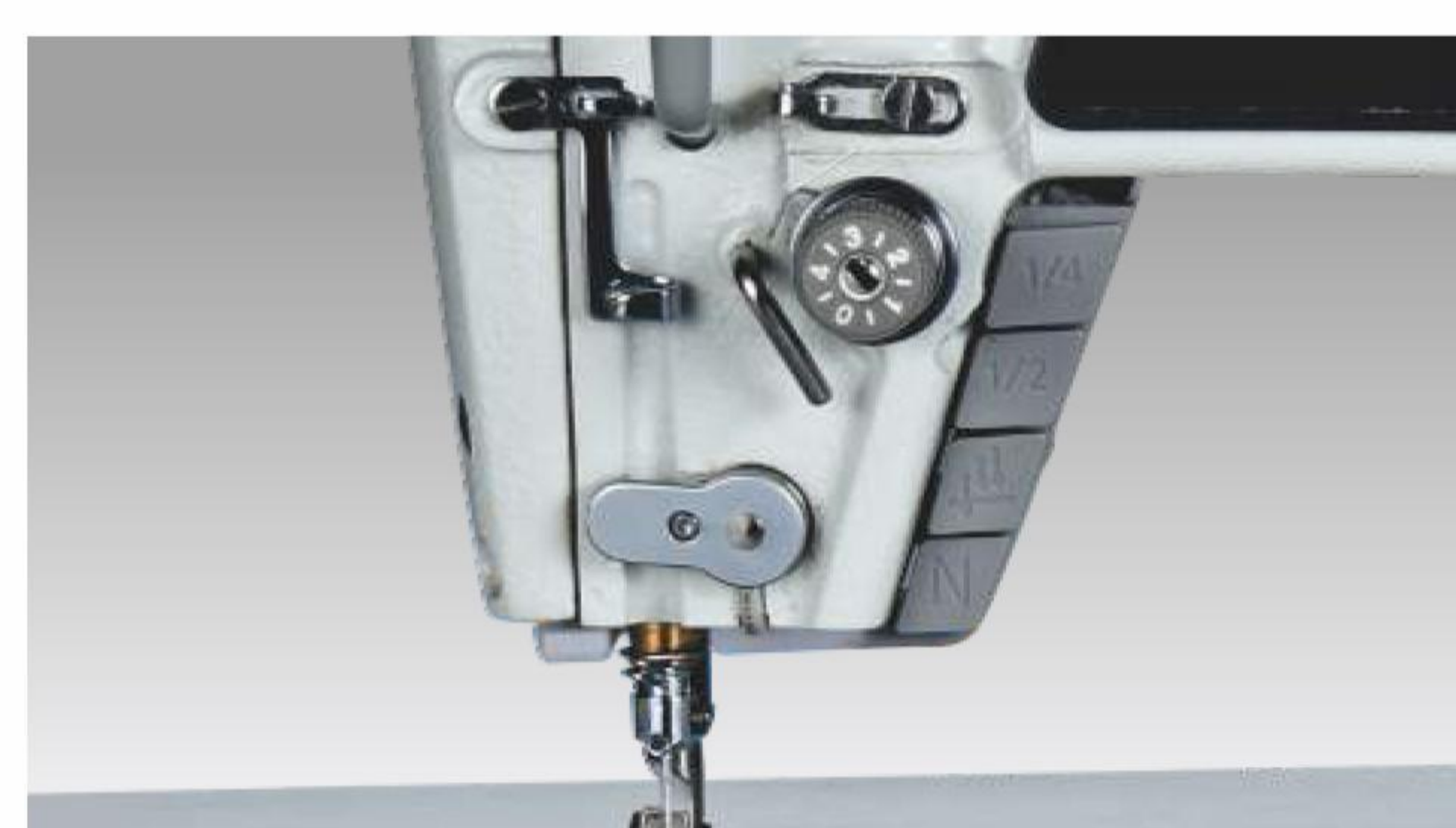
四键开关LED灯，增加1/4、1/2补针功能 Four-key switch LED light, add 1/4, 1/2 needle filling function