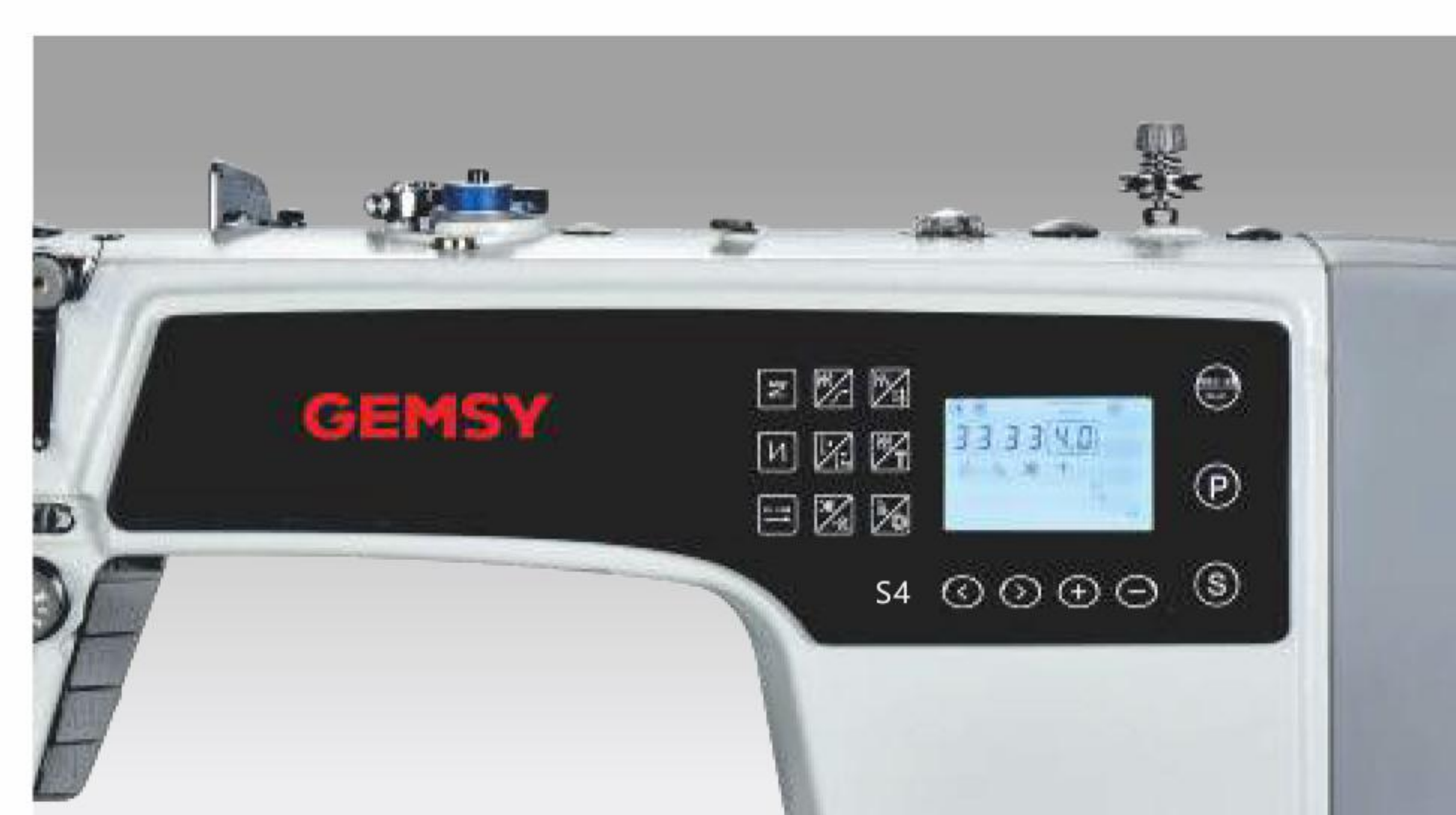
集成内嵌式的大屏操作面板，发光LOGO Integrated built-in large-screen operation panel, illuminated LOGO

The newly designed intelligent product has integrated electronic control, built-in large-screen acrylic operation panel, single-step motor control stitch distance, reverse sewing, thread trimming, presser foot lift, standard USB interface and other functions.