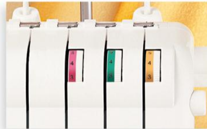
Built-in tension adjusting device