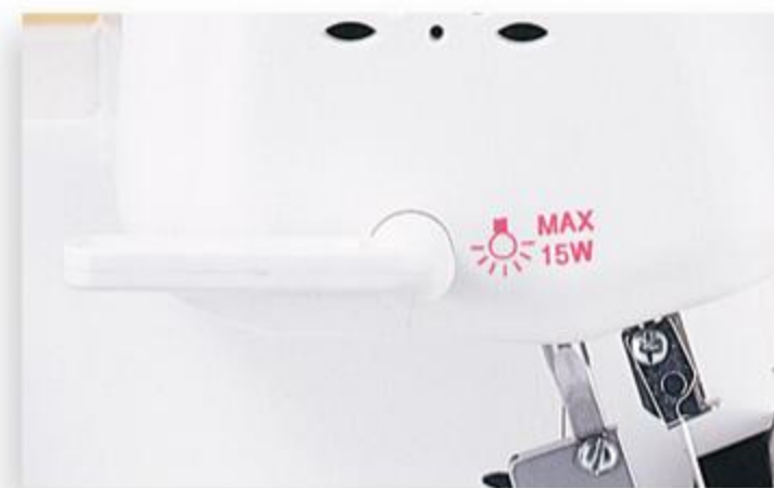
Built-in sewing lamp