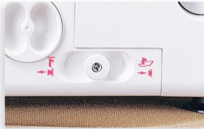
Built-in upper knife clutch device