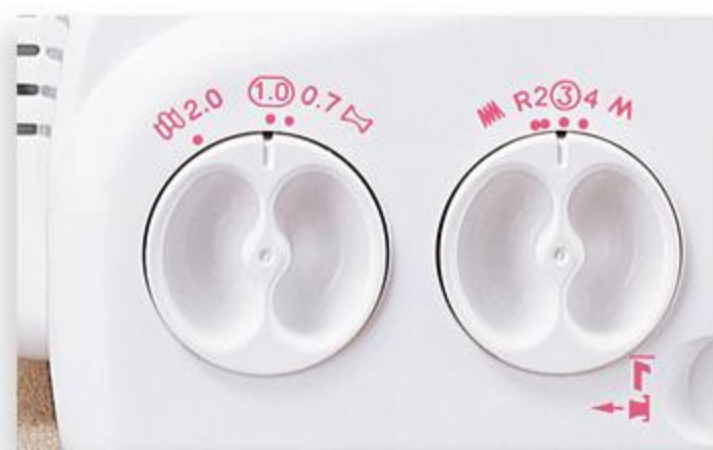
Differential and stitch length knobs